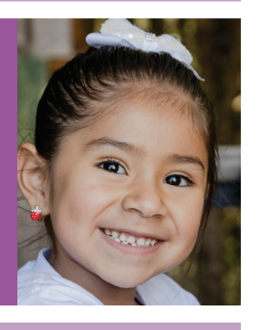
140 Children 0-5 years were screened for developmental delays

413 school age children and teens received increased educational support during virtual learning